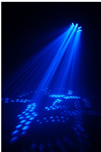
Example light patterns from tower

The artists will work with the at-risk students of the ALC to produce the bench cement forms, and with both the ALC and Brownie Troop 182 to produce the individual tiles specially designed for each bench (such as bats, lizards, plants). The artists will work with the residents of The Heritage at Gaines Ranch to mosaic the Austin based images onto the cement forms. This collaboration will provide a safe and positive avenue of artistic expression while bridging the social and generation gap between the groups.